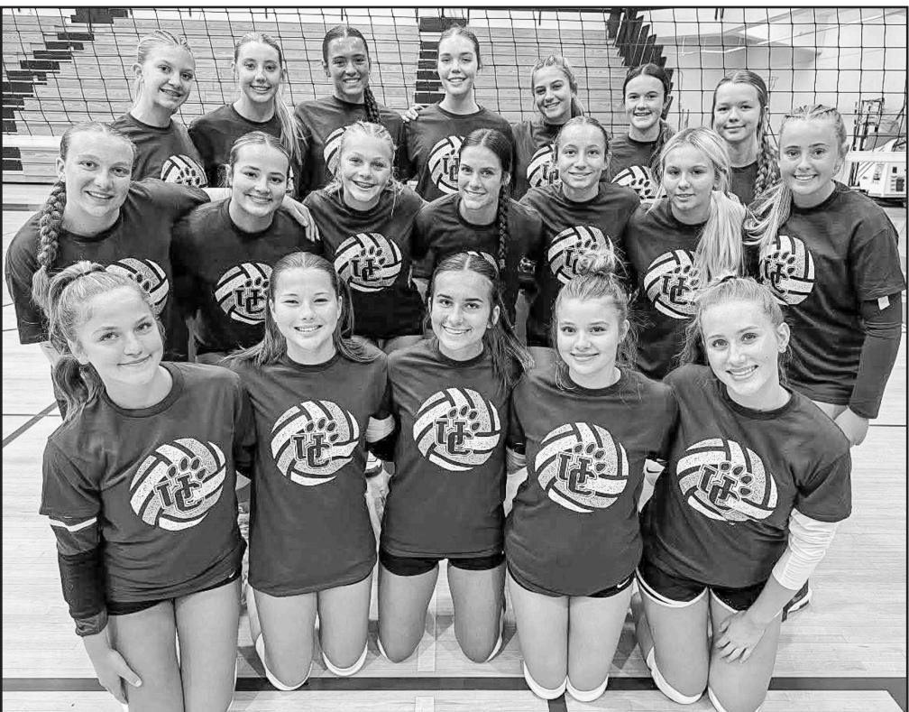
Union County finished 2-1-1 during summer games at White County last week.