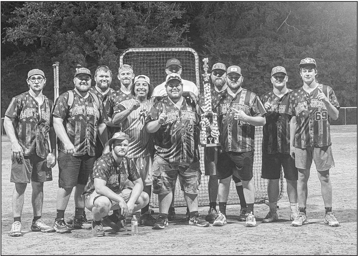
McClure’s Processing took home first place, defeating Nottely Crue in the finals of Saturday’s benefit softball tournament.